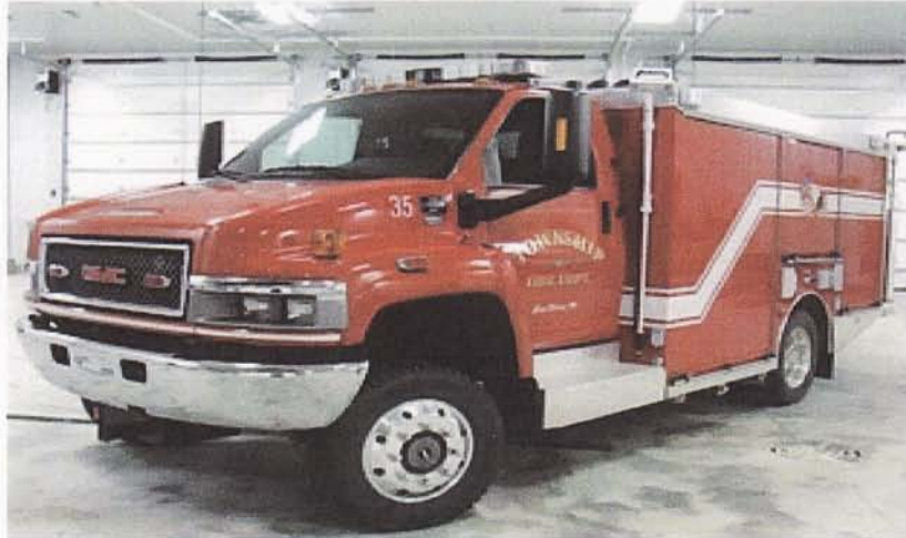
New Rescue 35 at Station 3